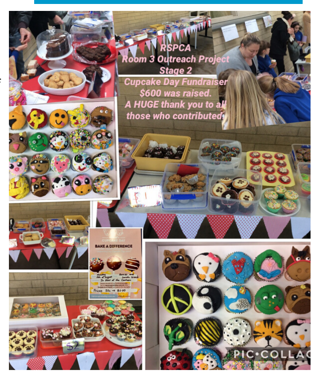
Room 3 at Crafers Primary School raised $600 for the animals at RSPCA by baking cupcakes and selling them to their schoolmates. THANK YOU ROOM 3